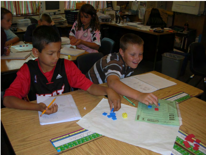
Use two dimensional coordinate grids to graph lines