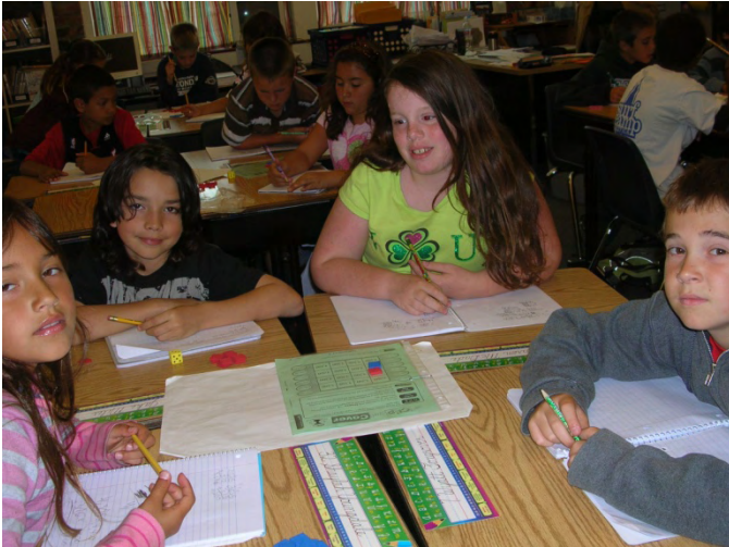
Understand an equation such as y = 3x + 5