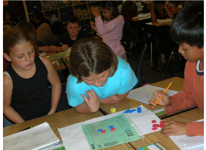
Evaluate math expressions with parenthesis