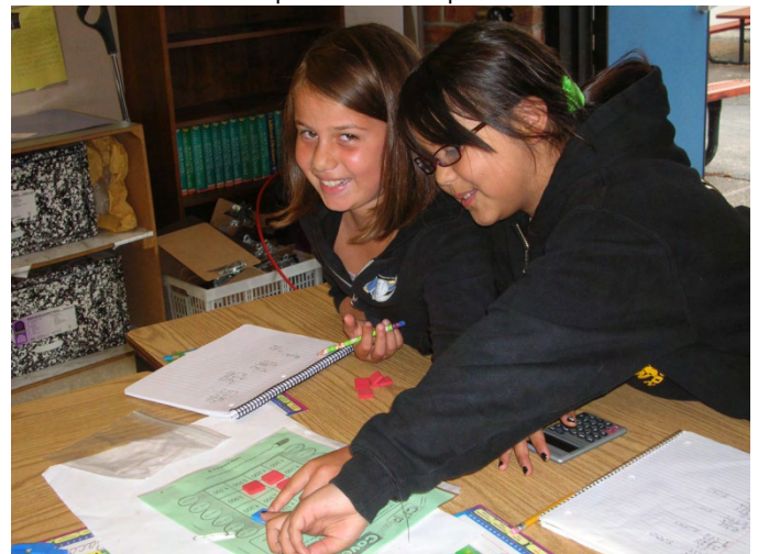
Understand perimeter and area