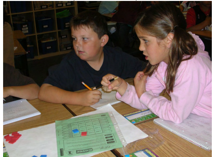
Know how to manipulate an equation